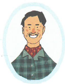
TENZING NORGAY (Sirdar)