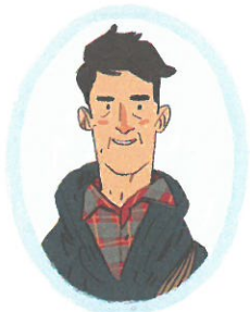
EDMUND HILLARY (Mountaineer)