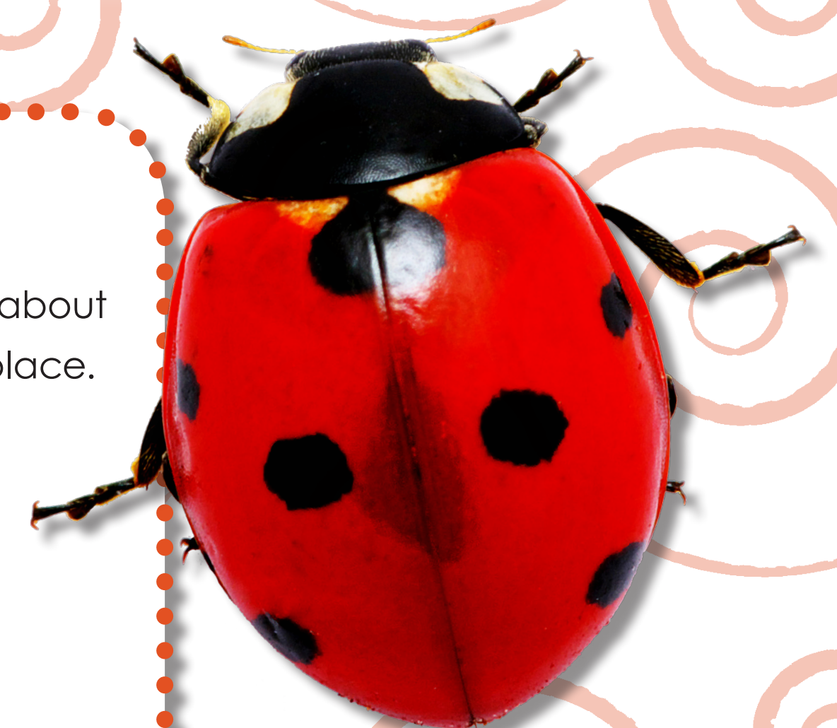
Coccinella septempunctata BRIGHT RED SEVEN POINTS