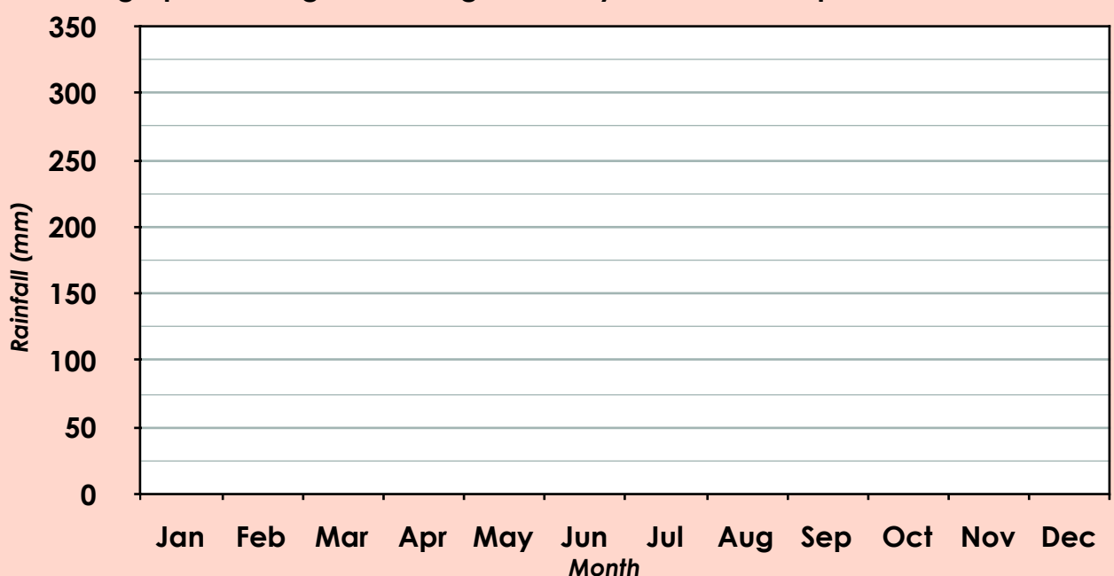
A graph showing the average monthly rainfall in a tropical rainforest