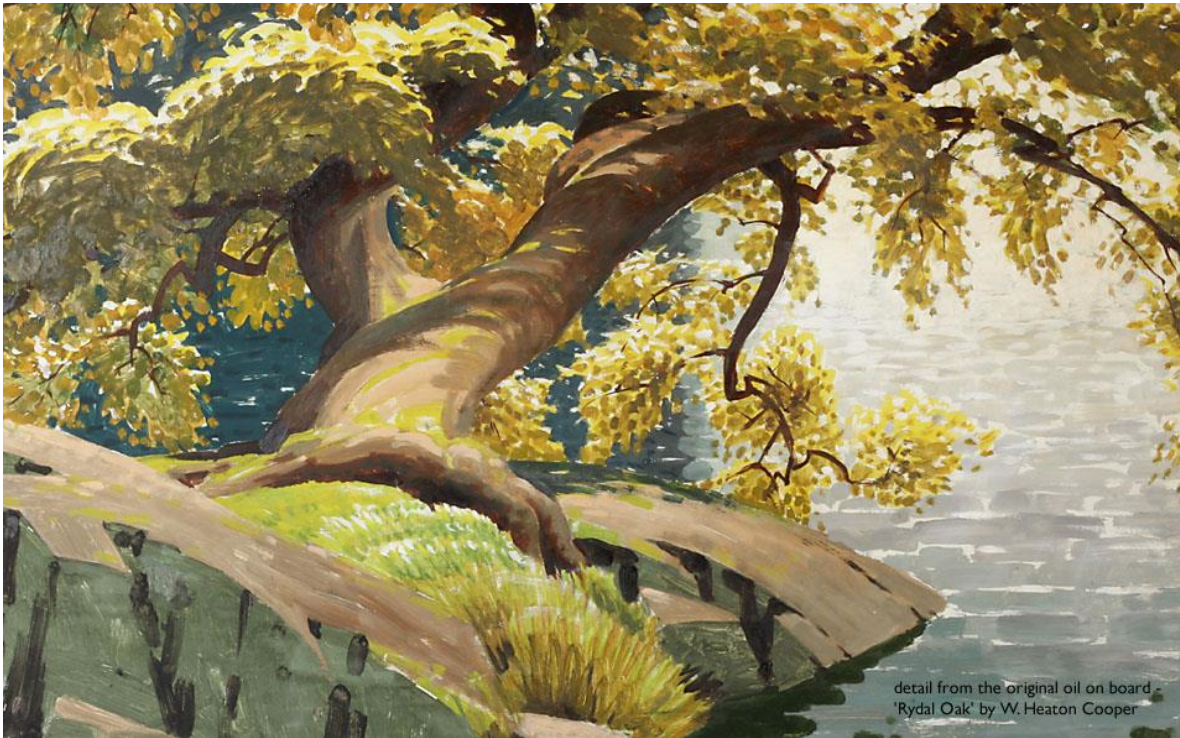
detail from the original oil on board 'Rydal Oak' by W. Heaton Cooper