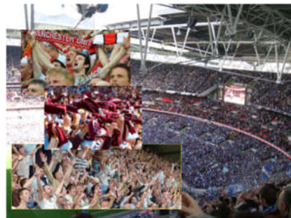
Non-religious places of worship.