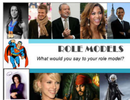
Role Models, Non-religious.

TASK: Use the template idea shown below to copy from , sketch into your workbook, your own place of worship.