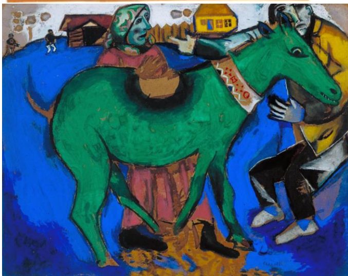
Why do you suppose the artist decided to paint the donkey green? Have you ever seen a green donkey?