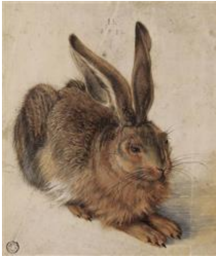
Albrecht Durer – Young Hare. Painted over 500 year ago