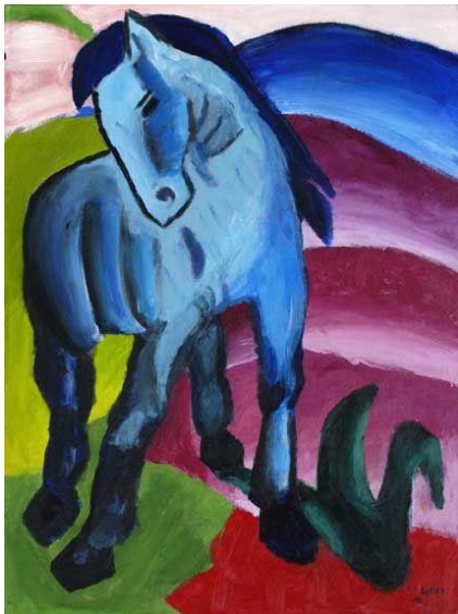
Franz Marc – Blue Horse

Do you like the colours in this painting? Is that a rainbow behind the horse or hills?