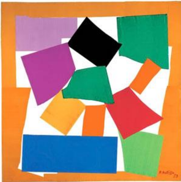
Can you see the snail as it's shell curls round and round?

I can see a tiger but how many different birds are there?