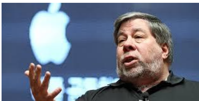
Steve Wozniak, Apple Co-Founder

'There was just something neat about the machine.'