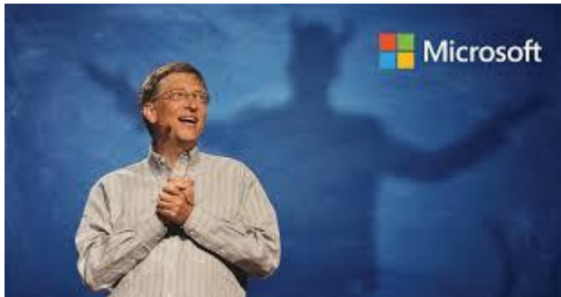
Bill Gates, Microsoft Co-Founder

'Learning how to program didn't start off as wanting to learn all of computer science or trying to master this discipline or anything like that, it just started off because I wanted to do this one simple thing - I wanted to make something that was fun for myself and my sisters. And I wrote this little program and added a little bit to it. And then when I wanted to learn something new I looked it up in a book or on the internet and added a little bit to it.'